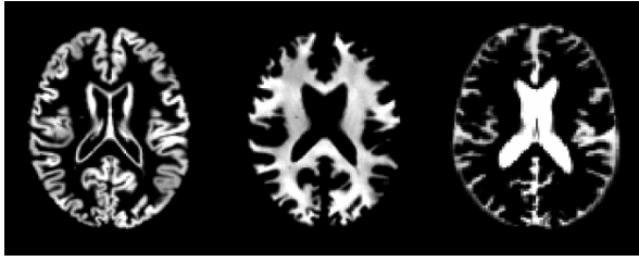
Figure 2: Segmenting of an AD patient into its three tissues: respectively from the right side there are GM, WM, and CSF.